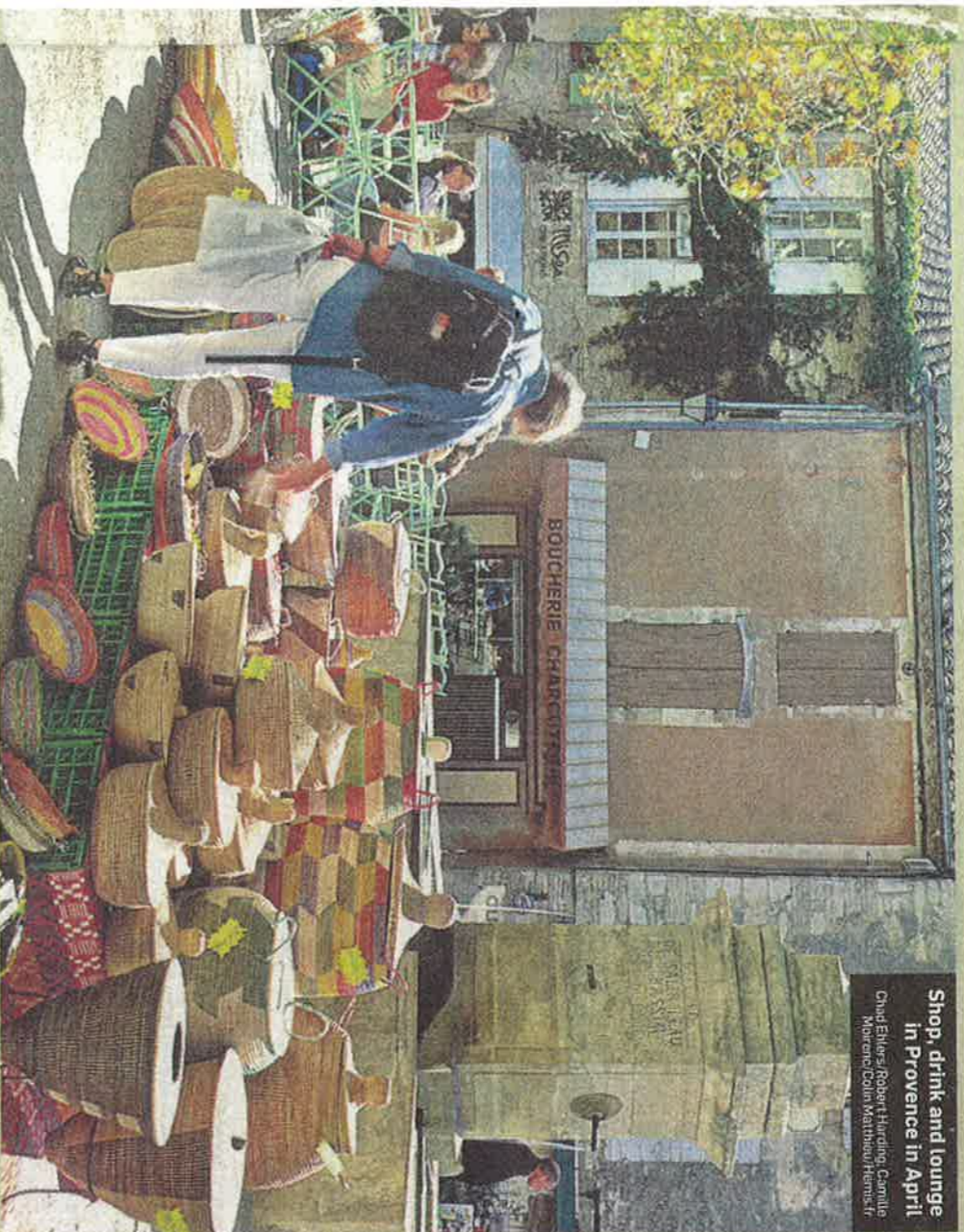
Shop, drink and lounge in Provence in April