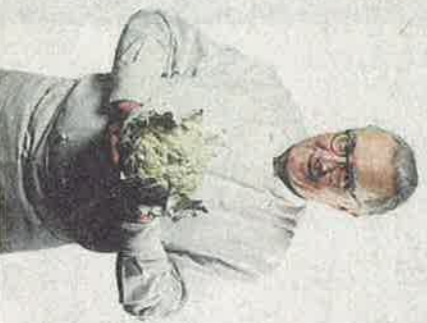
ALAIN DUCASSE, Chef

The Monaco Grand Prix is the one Formula 1 race even non-petrolheads want to go to — but it's pricey and it's hard to get a good spot. Try the European Grand Prix, in Valencia, instead: a semi-street circuit with good views and a beautiful, lively, affordable city, with beaches as a backdrop. In fact, even motorsport haters might