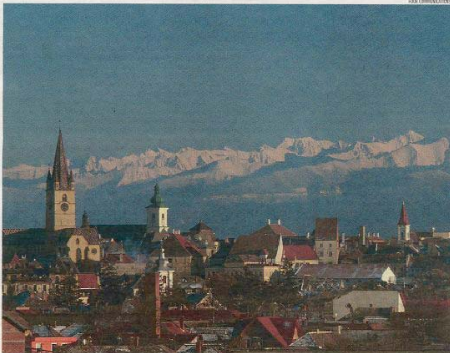
The snowcapped Carpathian Mountains rise above Sibiu's cobbled streets and vibrantly coloured medieval houses

Transylvania conjures up the usual clichés but its snowcapped Carpathian Mountains also embrace one of Romania's most romantic and historic cities. Sibiu still carries the scars of Nicolae Ceaucescu's regime but since it became European Capital of Culture (with Luxembourg) in 2007, it has worked hard to overcome its chequered past.