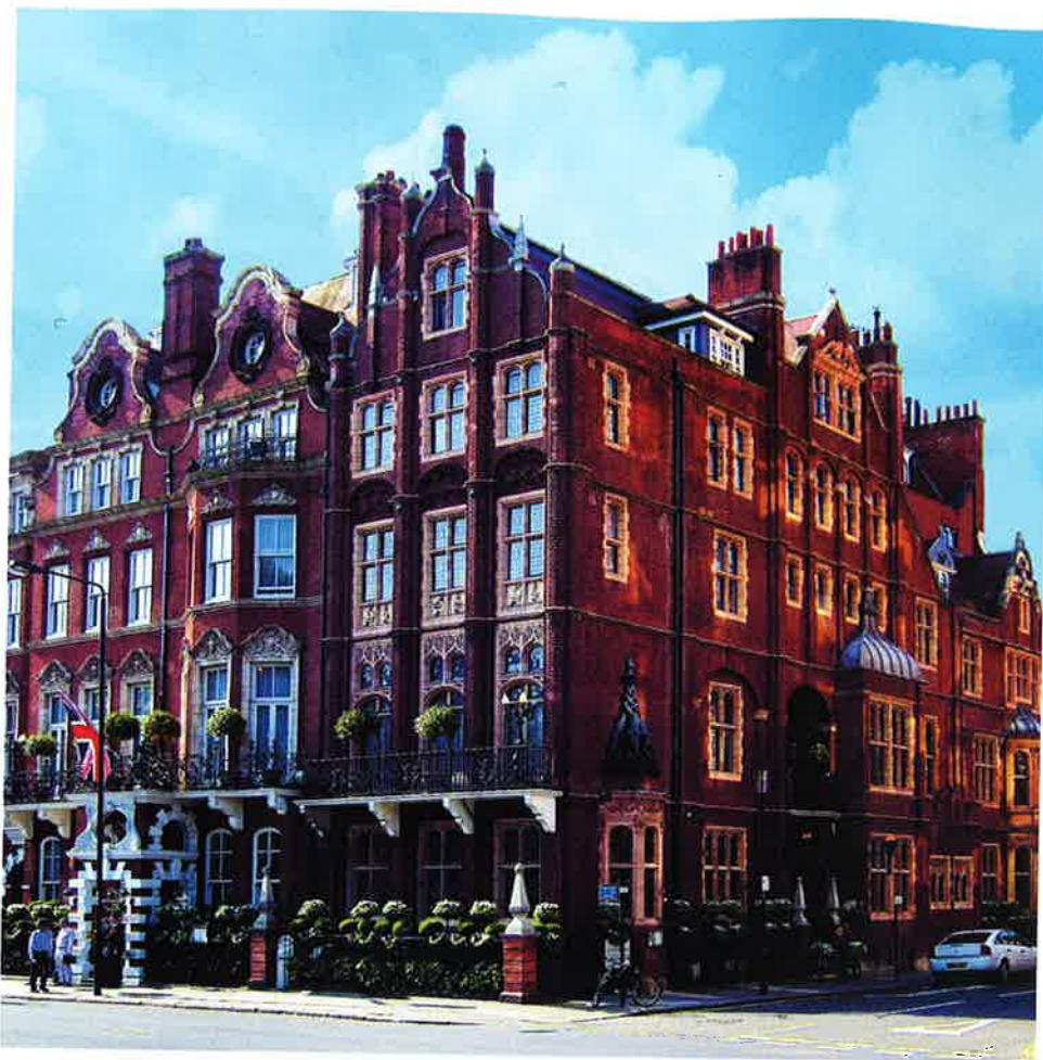
The Red Carnation Hotel Collection

Facing page: Coldstream Guards at a sentry box during the Changing of the Guard ceremony outside Buckingham Palace. Above and below: The Milestone Hotel features a luxurious spa.