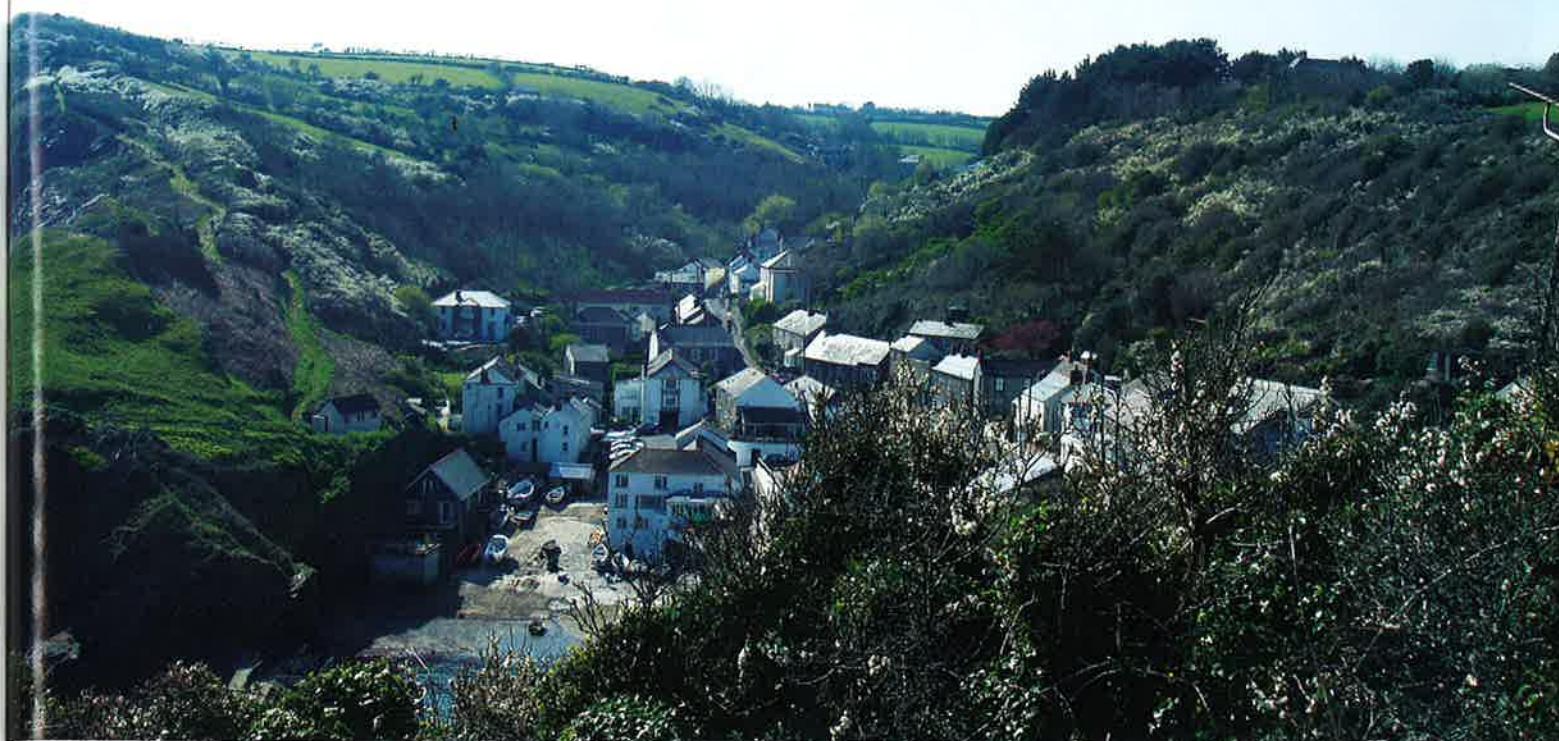
Portloe Village in Cornwall offers respite from the big city.