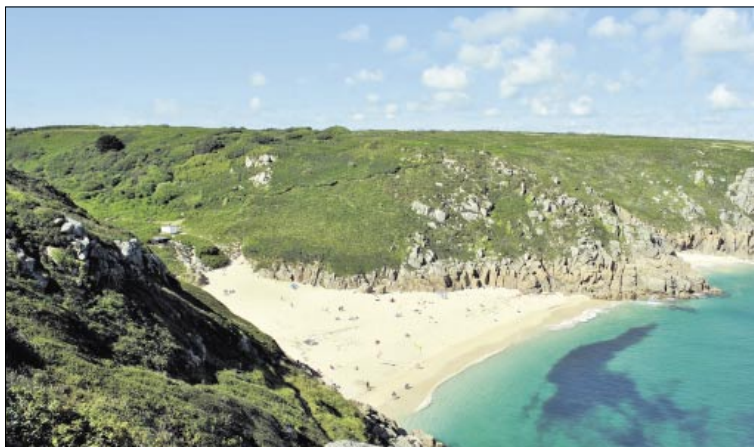
Porthcurno beach in Cornwall

talk guests through the menu, which has an emphasis on locally-sourced produce.