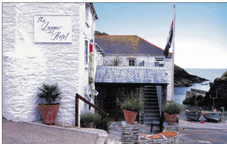
The Lugger Hotel, in Portloe, Cornwall