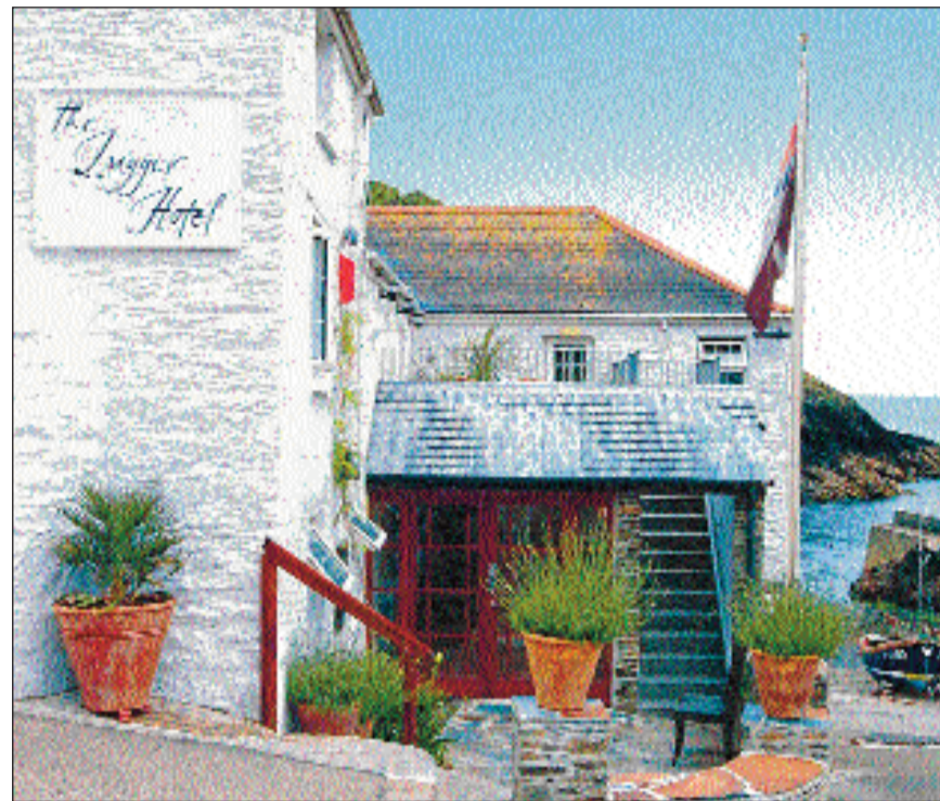
The tiny village of Portloe in Cornwall is the location of the Luggar Hotel, perched over the harbour

The food itself is well pitched. There are special meal times for the much younger ones, giving you plenty of time to settle them down before heading for your own. The menu in the beautifully-appointed restaurant is focused firmly on local produce and not surprisingly there's plenty of fish.