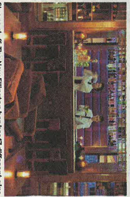
Strong stuff: The New Ellington bar has 17 different gins

HERE aren't many things more frustrating than driving around Leeds if you don't know where you're going. The one-way system sucks you in, then spits you out down a blind alley or on a bank by the canal. Even the nice Irish lady on my satnav falls silent, utterly bemused by the senseless brutality of the town planners. 'Turn around,' she says, finally. 'What she means is: 'Get the hell out of here.'